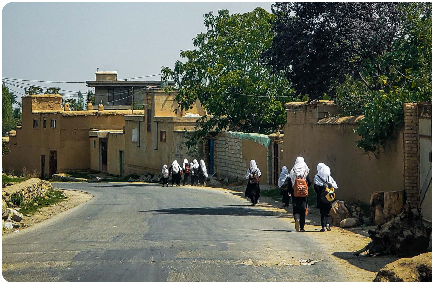
School girls in Paghman District, Kabul, Afghanistan (2022).