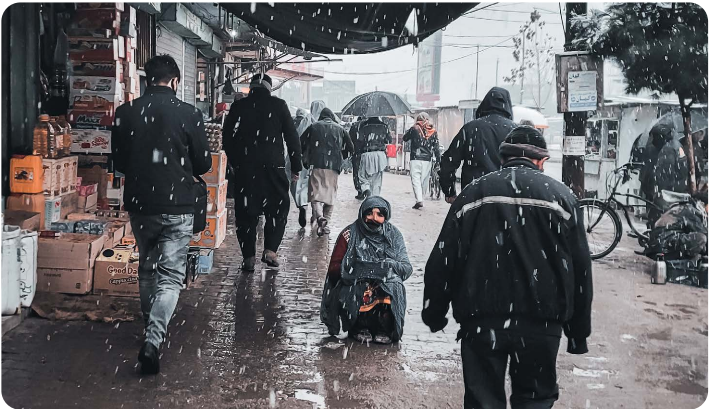
A homeless woman sat in a rainy street. Pol Shokhta Street, Kabul Afghanistan (2022).

A Ministerial Statement in September 2023 recommended a pathway for reuniting parents with children under 18, but implementation was delayed for nearly a year. This left vulnerable children to survive alone after separation from their families. The UK Government recently announced ACRS Pathway 1 Stage 2: Separated Families and the window to make a referral for those who are eligible ends on 30 October 2024.