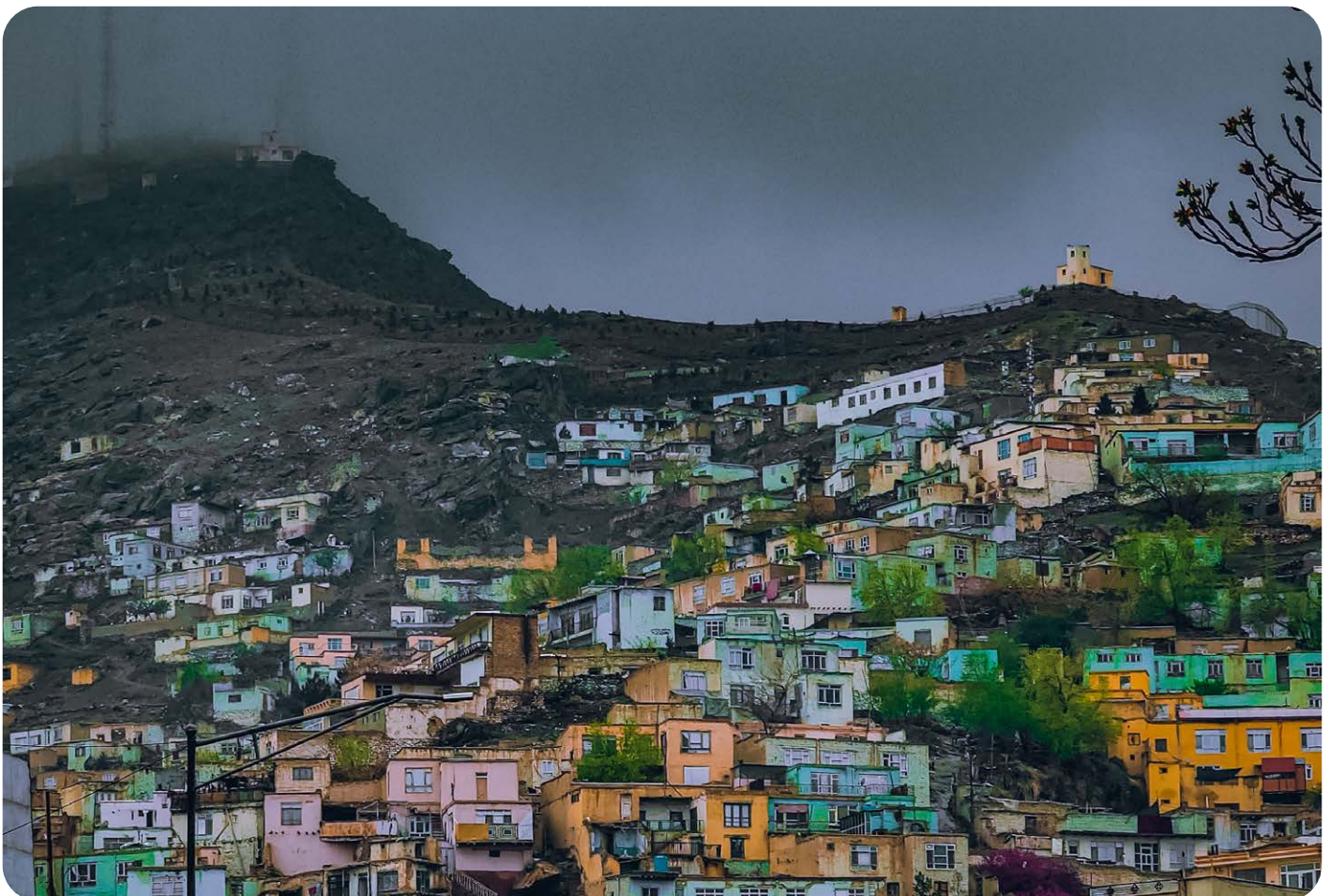
Colourful traditional-style houses on a mountain. Kabul, Afghanistan (2023).